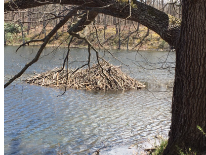
Beaver illustration by Jennifer Ramirez, 2020