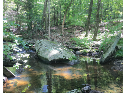
Rhododendron illustration by Jennifer Ramirez, 2019