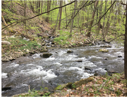
Hemlock